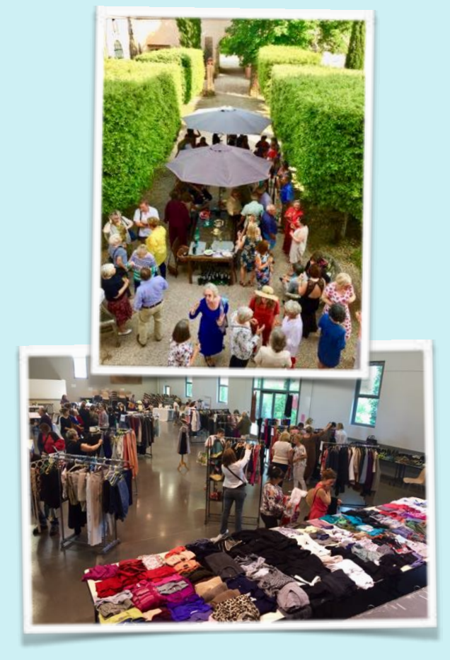
Friends in France International